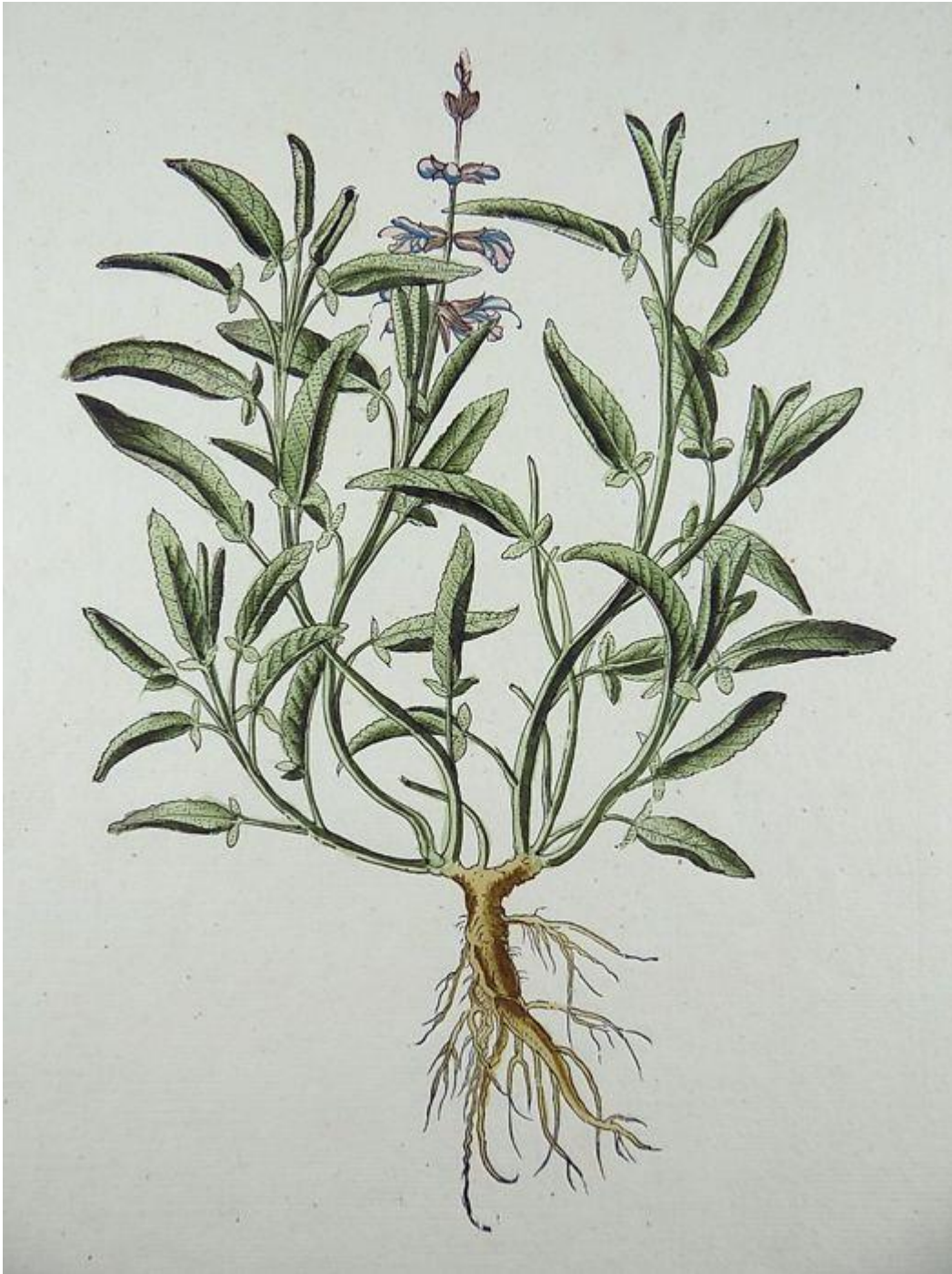
• Sage, Fuchs 1543

Should be hot in the first degree and dry in the second.