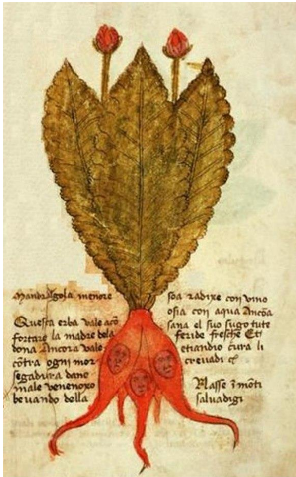
Mandrake, Fuchs 1543 and Trento 1591

A plant that depresses the central nervous system and is also associated with the human body due to the shape of the root.